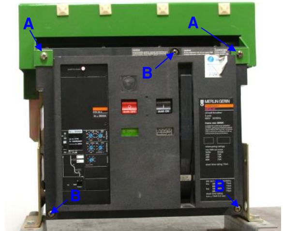
FIGURE 1, FRONT VIEW OF BREAKER